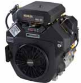
KOHLER 23 HP - Command Pro