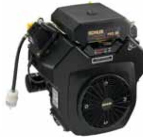
KOHLER 20 HP - Command Pro