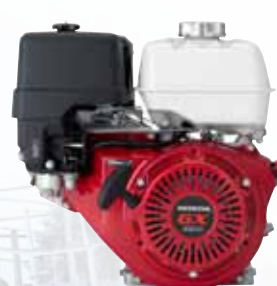
HONDA 13 HP - GX390