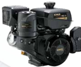
KOHLER 14 HP - Command Pro

H - Honda, B - Briggs and Stratton, K - Kohler. NOTE: Only pressure lubricated units are capable of 250 PSIG operation. Units tested in accordance with CAGI/PNEUROP Acceptance Test Code PN2CPTC3. Dimensions are for R-Series compressors. Add 1" to the width for PL units.