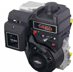
BRIGGS & STRATTON 8 HP - 1450 Series